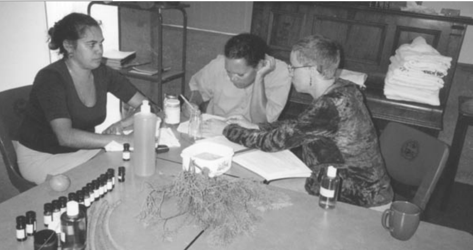
Health workers discuss the preparation of bush oils

The widespread appeal of sports massage in Kempsey presented a valuable opportunity for addressing not only musculoskeletal conditions but also some of the major risk factors associated with mortality and morbidity in this and other Aboriginal communities. These risk factors include: