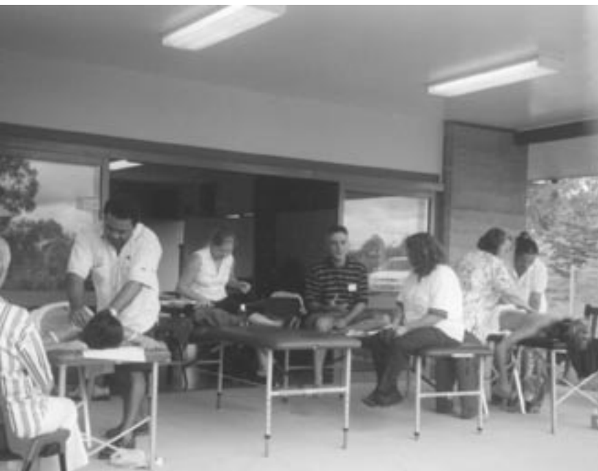
Aboriginal health workers practise their sports massage skills

The sports massage course was supported by the Chiropractors' Association of Australia (CAA) National, Hands on Health Australia (HOHA)*, The Murray School of Health Education, Health Schools Australia and Booroongen Djugun Aboriginal College. It has been accredited nationally and will allow graduating Aboriginal health workers to practise in a range of community settings including Aboriginal health services, sporting clubs, voluntary community health clinics and private practice.