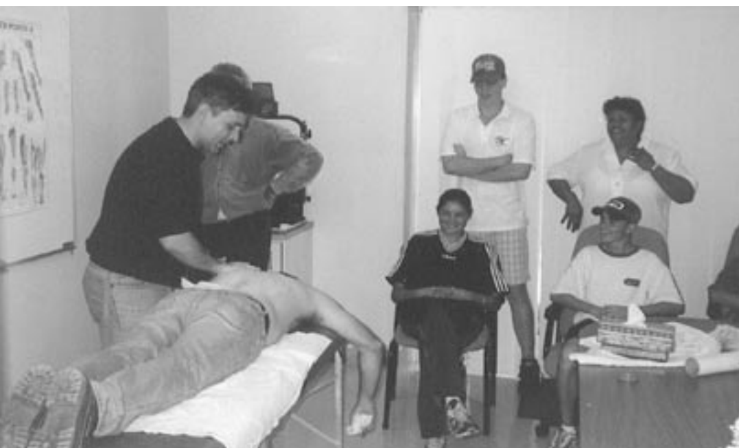
A massage workshop run for high school students at Brewarrina, NSW