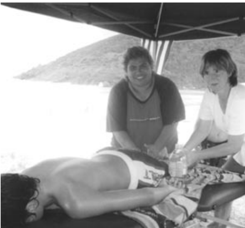
Health workers practise on the 'nippers' at surf rescue carnival

Kakkib li`Dthia Warrawee`a is an Indigenous elder, philosopher and naturopath. He believes that the “greatest insult that one can possibly express in his language and community is to say that someone is dtoong; karla ; unable to see things in perspective and from different points of view”.